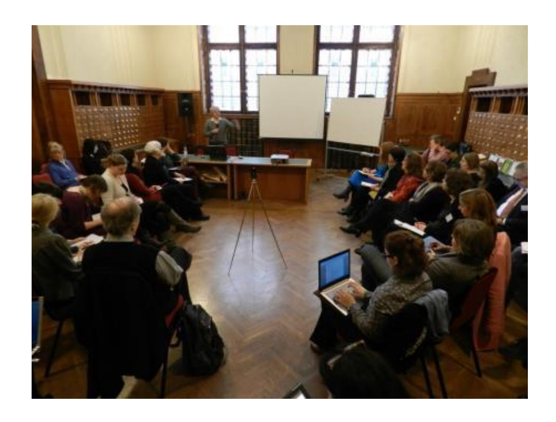
Concentration in the Class